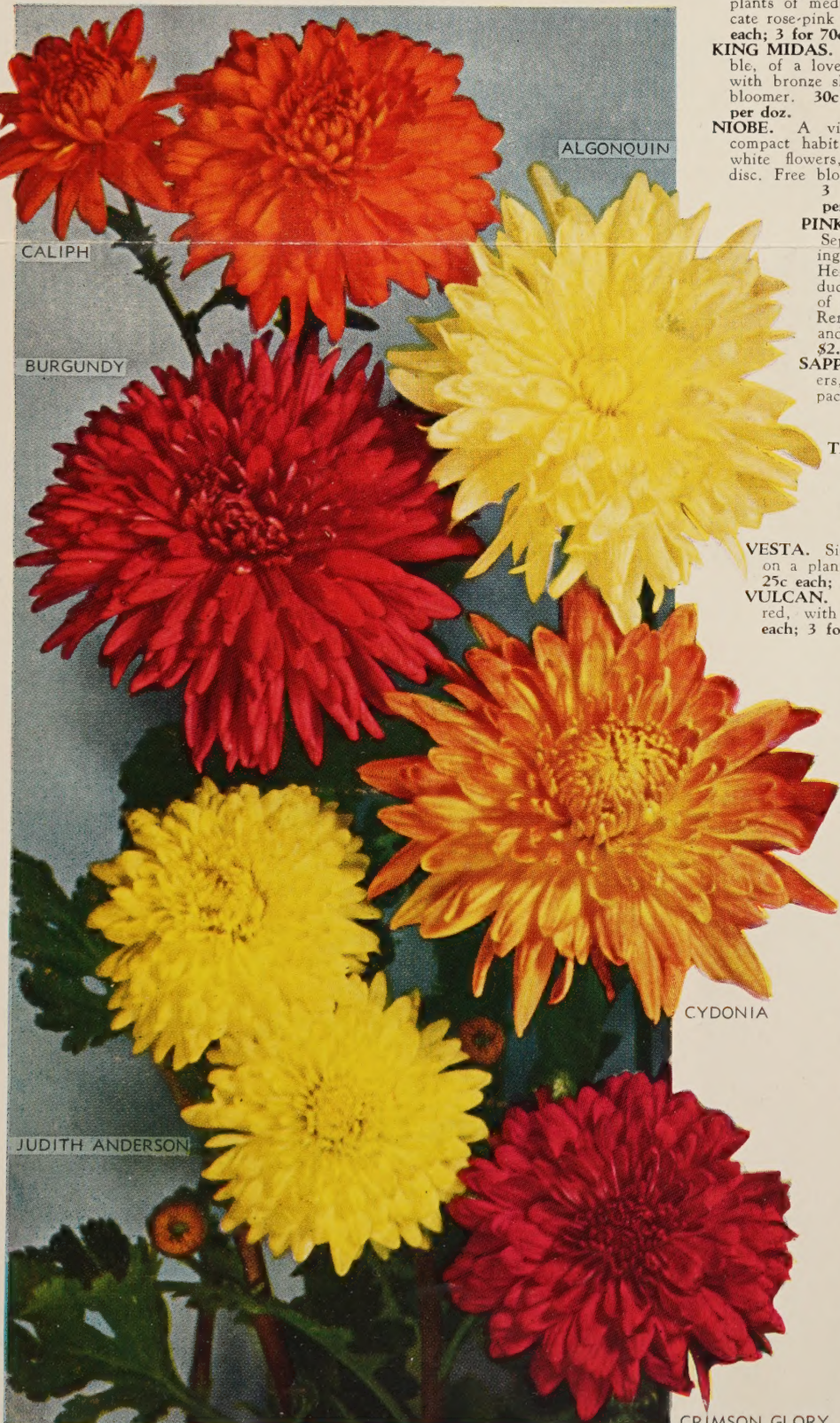
Hardy Garden Chrysanthemums